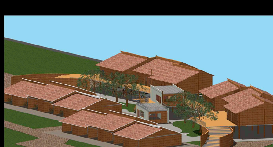
RESIDENTIAL COURTYARD PERSPECTIVE