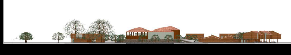
MAIN AND LATERAL VIEWS OF VILLAGE ARTS