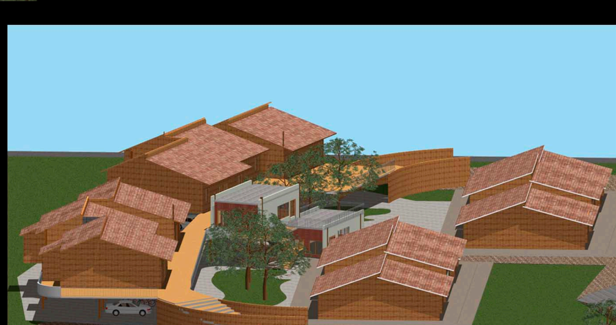
MULTI PURPOSE BUILDING (CONFERENCE CENTER - EXPO HALL - MEDIATEC -